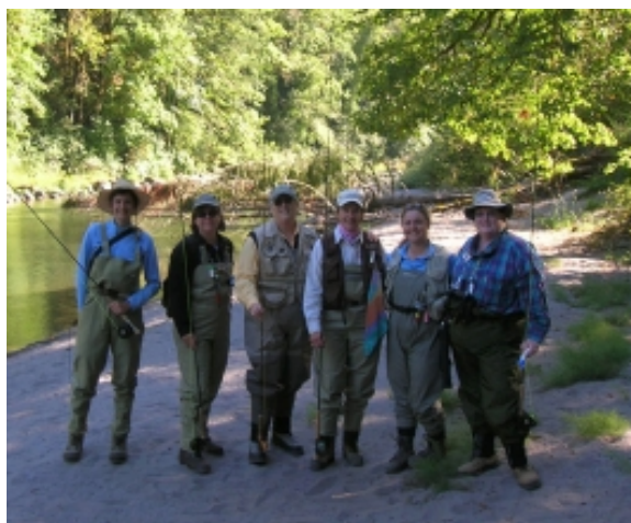
August Fish-a-long on the Kalama

to showing up at the monthly meetings. If you are one of those who often forget the meeting, being on the board will keep you "in the loop" as we are usually emailing about club business off and on during the month.