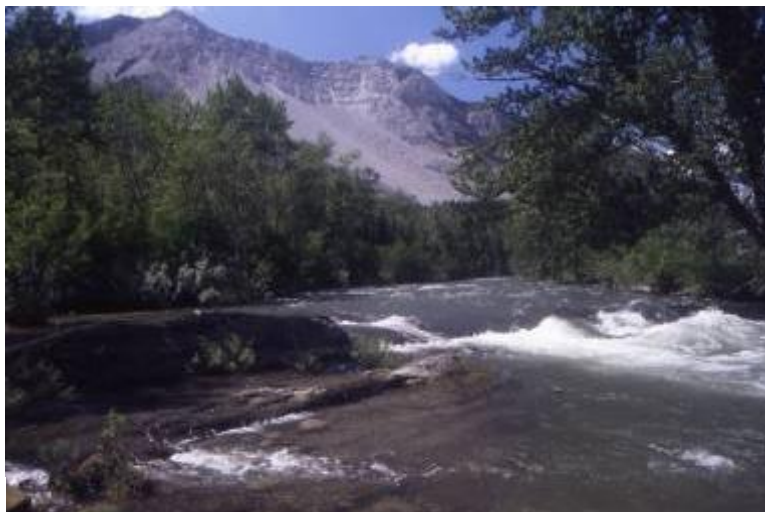
Crow's Nest River, Alberta, Canada

For more information on Elderhostel, go to www.elderhostel.org