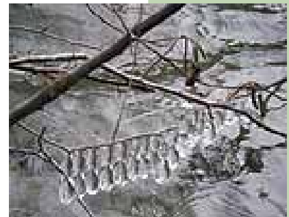
Lewis River Icicles

"Do not tell fish stories where the people know you; but particularly, don't tell them where they know the fish" -Mark Twain